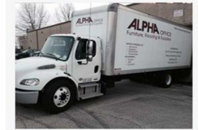
Delivery & Storage

APS is setting the industry standard for commercial and residential Lighting & Controls and Electric Supply . The company is aligned with America’s leading engineering, architecture, design firms, and manufacturers. We have created a unique way of bringing together Lighting & Electric Supply manufacturers to provide competitive pricing. Call for Quotes.